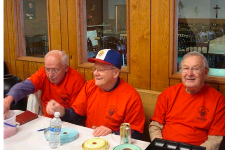
Friendly faces at the meal ticket table.