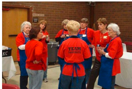
The Ladies "amping up" before the Fish Fry.