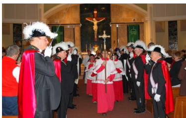
Honor Guard stand at attention while clergy and altar servers processed out.