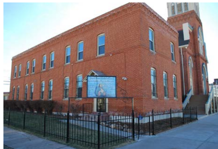
Formerly the rectory, the building now houses the religious education classrooms and other offices for Sacred Heart Church.