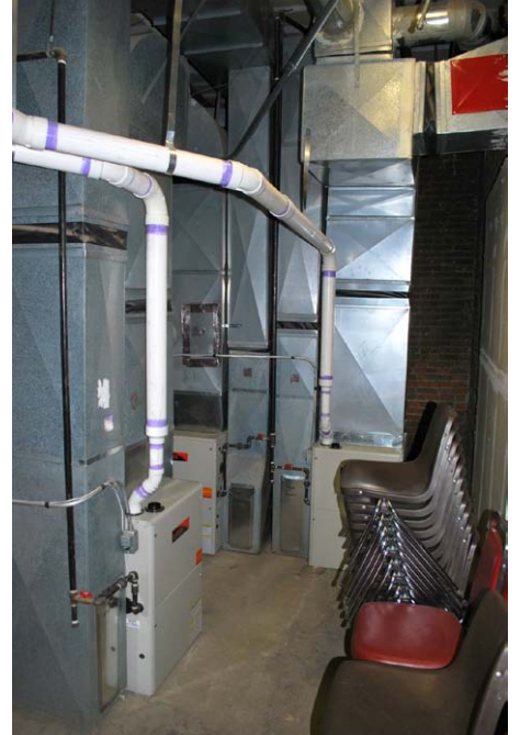
As part of the upgrade to Sacred Heart Church and rectory, a new high-efficiency heating system was installed as well as new windows.