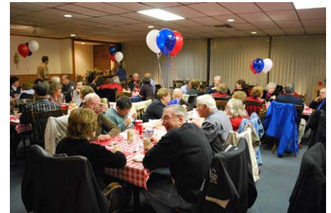
Over 40 people attended the Council's "Wives Appreciation" dinner held in conjunction with the Boy Scouts Parish Spaghetti dinner.