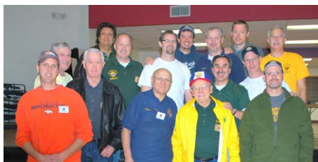
The Knights were well represented by Council 10205 and 1498 at this year's Free Throw contest at STM gym. Many hands make the job a lot easier. Thanks, fellow Knights!

Good luck to all the winners at the upcoming District contest which will be held on February 14th at Castle Rock Recreation Center, 2310 Woodlands Blvd, Castle Rock, CO from 9 a.m. to 12 noon.