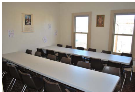
The tables and chairs shown above are some of the furniture made possible by a $1000 donation made by Council 10205 for the religious education program at Sacred Heart Church.