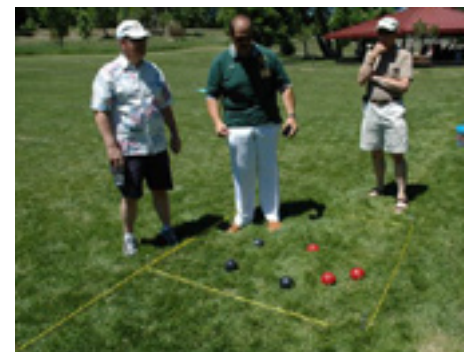
"Just how many Knights does it take to count the Bocce Balls? It depends on whether or not they had their shoes on or off (Toes)