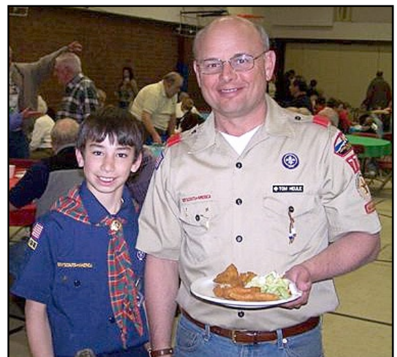
FISH FRY ATTRACTS MANY: Food, fun and fellowship marked the first of five fish fries sponsored by the Council. The March gatherings are an excellent way for parish families to get to know each other. More Fish Fry photos on inside pages. ►►