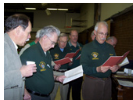
The Knights' choir sing at the Stations of the Cross after the Fish Fry.