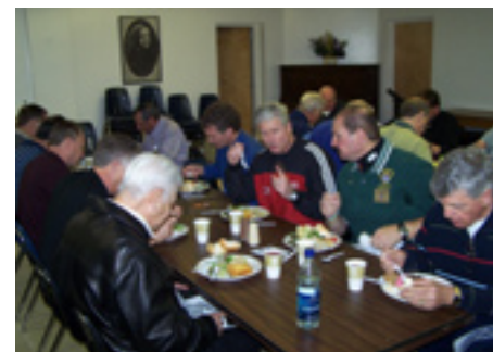
Many discussions filled the room at lunch during the retreat.