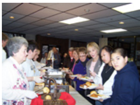
The food line was handled smoothly in the Padre