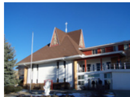
Mother Cabrini Shrine.