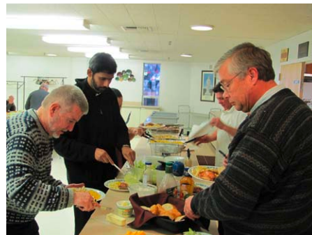
Chow time at the retreat.