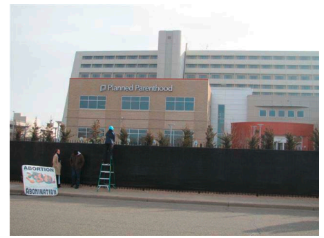
Pro Lifers plead with women entering the Planned Parenthood abortion center.