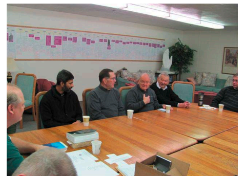
Quote of the day: "if I'm judged in heaven, I'm happy because I'm there!"-- Russ Pitrone