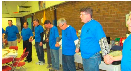
Team Fraternity gathers for prayer before the Feb. 26 Fish Fry