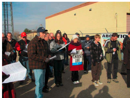
An estimated 200 Catholics gathered to say the Rosary at Planned Parenthood, while the Denver Police cruise the area.

* The Southeast Deanery includes St. Thomas More, Church of the Risen Christ, Most Precious Blood, Our Lady Of Lourdes, St. Vincent DePaul, St. Louis and St. Francis DeSales Catholic Churches.