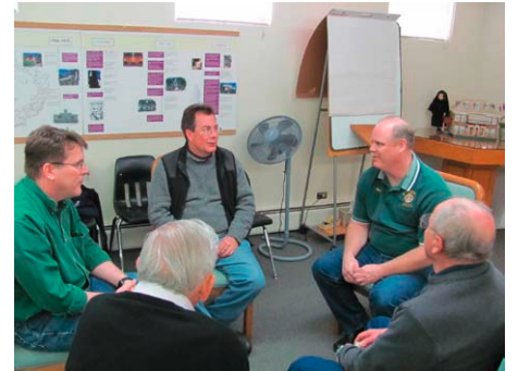
Breakout sessions in comfy comfy chairs at the Council retreat.