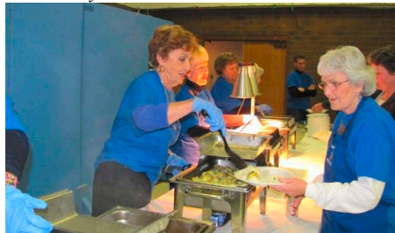
The Ladies Auxiliary were a great help serving food at the Feb 26 Fish Fry, as they are at all Fish Fry's. We really appreciate their help!