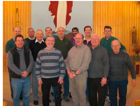
Brother Knights gather for Mass at the Council Retreat, Feb. 20th.