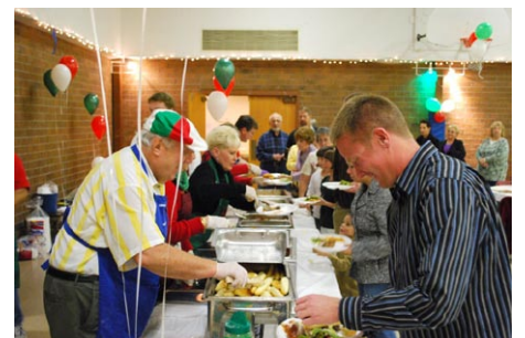
The buffet line was stuffed with all kinds of meats, pastas and sauces that made your eyes water, or was it the garlic?