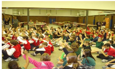
Kids were attentive at the FOCUS 11 vocations day at St. Thomas More.