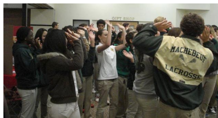
Eleventh Graders move with the music at FOCUS 11.