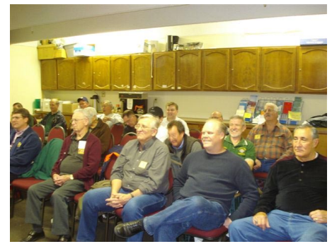
Council members listen attentively to the presentation about Alexander House on October