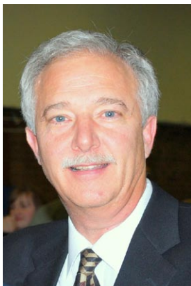
KNIGHT OF THE MONTH COUNCIL 10205 AUGUST, 2009

Don exemplifies what it means to be a Catholic Gentleman and is very active in his continued faith formation.