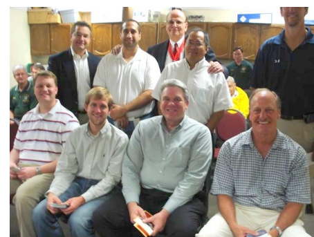
Welcome to 8 new Brother Knights, who took their 1st Degrees October 20, 2009!