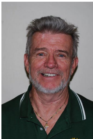
KNIGHT OF THE MONTH JULY, 2009 COUNCIL 10205