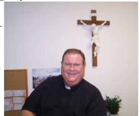
"I'm a huge Rockies fan."