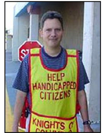
Council members collected $4,783 handing out Tootsie Rolls at area stores during September. So far, three charities have been recommended to receive funds: Cottonwood, the Bridge trust and Coffee House