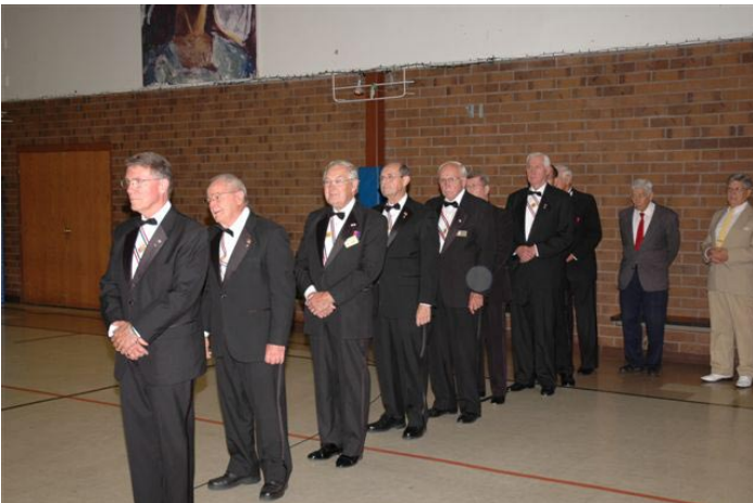
Newly elected Officers line up to be installed.