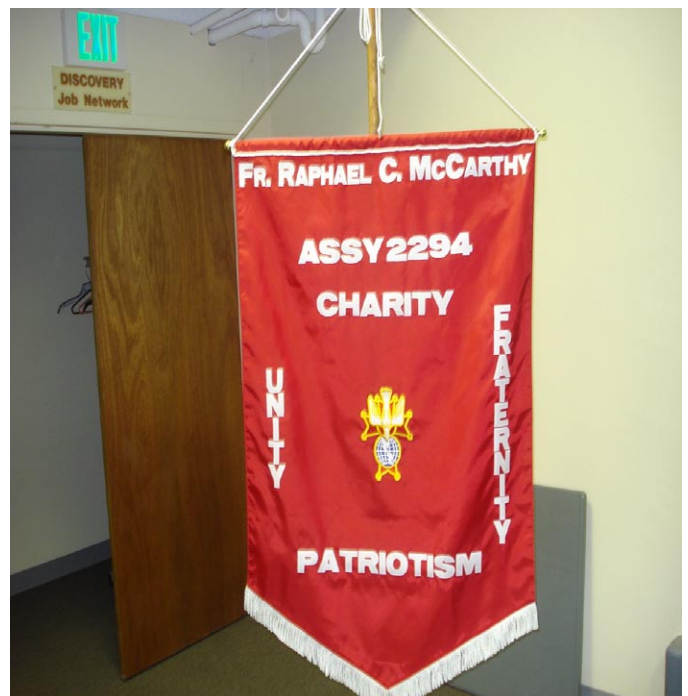
The Assembly's new banner, made by the "Stitchers" at St. Thomas More